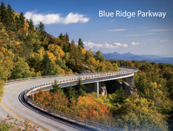
Blue Ridge Parkway

Hungry to open up your bike and go for a long summer scenic ride? Looking for beautiful visuals and loads of twists, turns, hills, and drops? Then check out these 5 great rides: